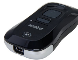
USB Wireless Barcode Scanner